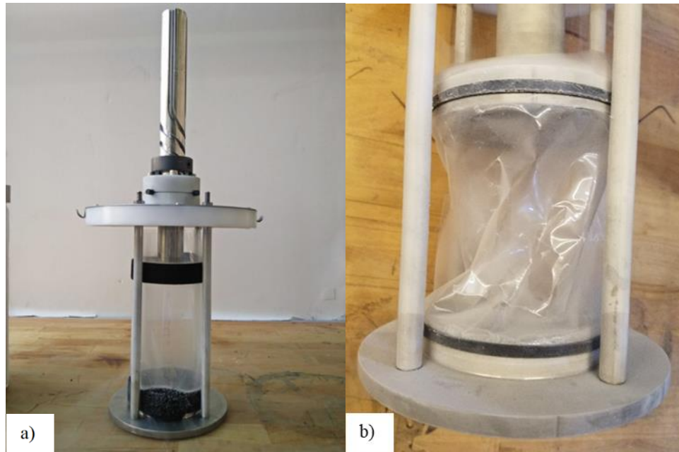
Fig. 1 a) Gelbo flex test apparatus after testing, with a film secured to the mandrels. b) Test apparatus in the midst of twist-flex testing.

and low-profile Nylon cable tie for clamping the sample to the upper mandrel and lower mandrel, respectively. Dimensions for the mandrels are a diameter of 88.9 mm (3.5 inch), and a thickness of 12.7 mm (0.5 inch). A 304.8 mm (12 inch) grooved shaft fixtured to the upper mandrel guides the test through a prescribed actuation path, subjecting the polymer film to two phases of deformation: 1) the first phase simultaneously twists and compresses the polymer film by 440 degrees and 90 mm, and 2) the test further compresses the film by another 65 mm. Reversal of the process completes a cycle. The movement of the grooved shaft was completed manually.