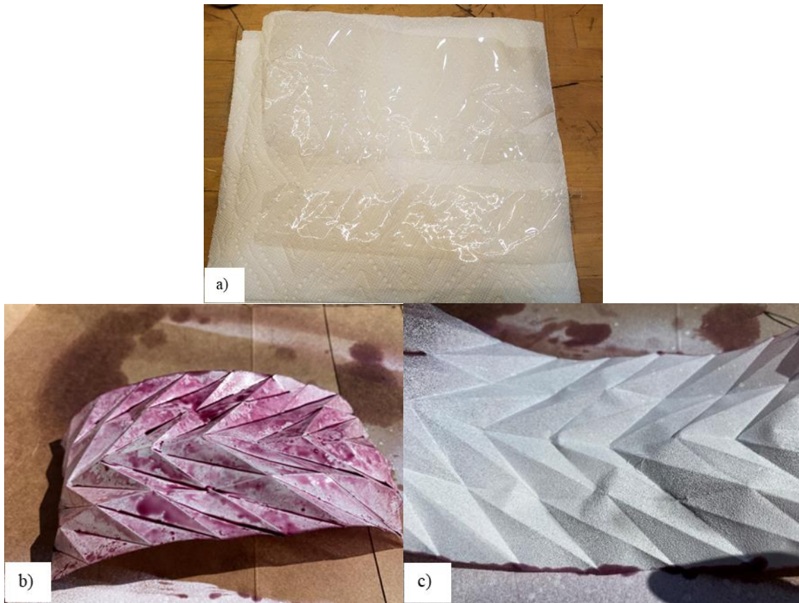
Fig. 4 a) Tear in sample. b, c) Kresling bellows subjected to dye penetrant testing.

The lack of identified pinholes within the tested bellows supports the notion that deformation is primarily elastic, and as such, origami bellows may be useful as mechanical actuators at cryogenic temperatures. An origami bellows could be used as a foldable substrate for electronics [19]. Capping and sealing one end of a highly compressible origami bellows may allow the device to be used as a positive displacement fluid pump, expulsion bladder, or expandable burst disk. One implementation of the above fluid technologies that could be explored is a multi-layer bellows to enable circulation of refrigerant between layers for zero-boil-off liquid storage. Washington State University has filed a provisional patent application, under patent serial number 62/972,745, for such a device. As much of these applications primarily manage fluids, they must remain seal-tight (i.e. no pinholes or leak-paths must form). Other tests, including helium leak tests with a mass spectrometer, may rigorously quantify if pinholes form in