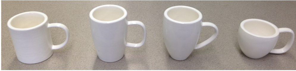
Figure 1. Drinking mugs used for ranking task (from left to right: A, B, C and D).

In the second part of the study, participants were asked to perform a ranking task. Participants were asked to independently rank 4 drinking mug designs in order from most appealing to least appealing. The designs chosen for this task are shown in Figure 1. These specific designs were chosen to represent significant variety across the three attributes. This allowed the participants' explicit ranking to be compared to the ranking predicted through conjoint analysis.