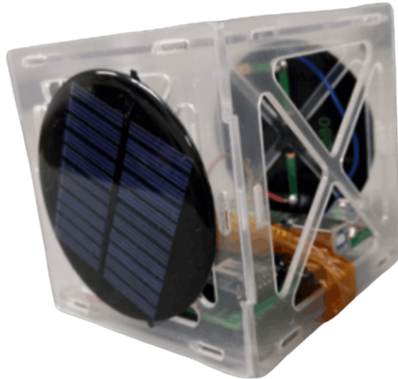
Figure 1: Starkcom Global Network CubeSat v1.0