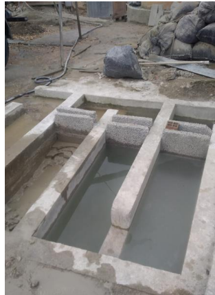
PHOTO 2 Tanks WWTP

The concrete industry required a different type of structure. To achieve this, a wastewater treatment plant was designed with permeable concrete panels that facilitated the passage of water, while other elements, such as cotton and organic charcoal, contributed to the retention of suspended solids. This waste was safely collected and stored in sacks, where the moisture evaporated, allowing the production of a reusable cementitious material.