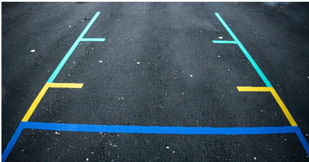
Figure 3: Parking guidelines with 4× MSAA. Observer rating improved from 1.4/5 to 4.6/5 (n=20, p<0.001 via paired t-test). Diagonal segments are smooth; staircase artifacts eliminated.

Reasoning: 4× MSAA provides sufficient subpixel sampling to smooth diagonal edges. Higher sample counts (8×) showed no perceptible improvement in pilot testing (4.6 vs 4.7, not significant), so we capped at 4× to minimize memory cost.