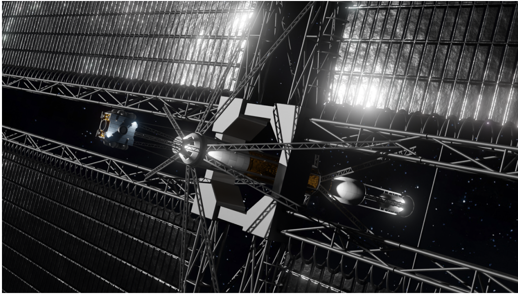
Figure 5: Solar One - Nuclear reactors at the right, cockpit in the middle, and photon rocket at the left Animation made by Marco Purich

Once the destination is reached, the crew could orbit the exoplanet, take images and send a robot to the surface. If the air turns out to be breathable, the crew could choose to land in order to personally explore the exoplanet.