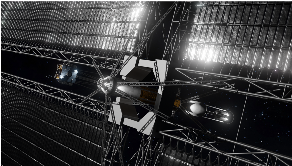
Figure 5: Solar One - Nuclear reactors at the right, cockpit in the middle, and photon rocket at the left Animation made by Marco Purich

The light sail could also be placed in the middle of the sail instead of behind, reducing the amount of structure needed and probably the overall weight of the spacecraft.