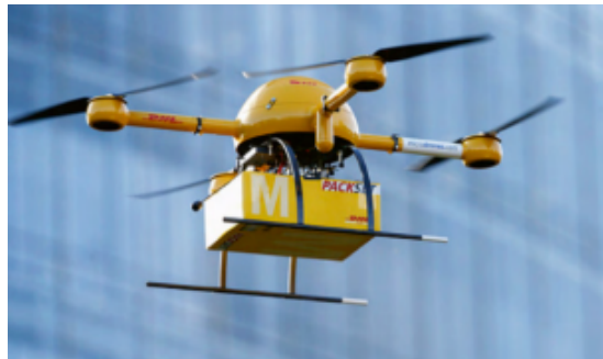
Figure 2: DHL Paketcopter Delivering Packet [13]

The real-world examples to industrial robotics in logistics were trailer and container loading robots, stationary piece picking robots, mobile piece picking robots, co-packing and customization, and home delivery robots [11], moreover, all this sort of industrial robots instance were based on Autonomous Mobile Robots (AMR), Automated Guided Vehicles (AGV) and Unmanned Aerial Vehicles (UAV) type, AMR and AGV had similarities, both were operated on-ground, but AMR more sophisticated in terms of technology, compared to AGV it was worked in the less constrained world, so its utility and mobility enhanced [12], whereas UAV type was operated on-air, UAV would automatically pick up allocated shipments from the conveyor belt and take off, in case of return to the hub UAV could carry out point to point deliveries which lay on the routes [13], Figure 2 shows UAV (DHL Paketcopter) is delivering goods.